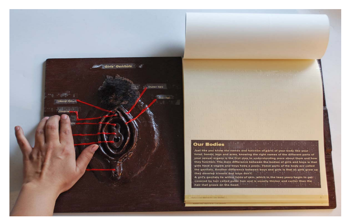
Illustrations with accompanying text for the sighted and braille for the visually impaired. The female body, detail of th euterus and external reproductive organs.